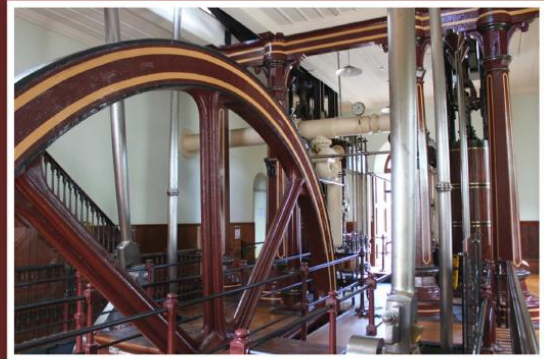
The 1877 beam engine at the former Auckland Waterworks and Pumping Station at MOTAT, Western Springs.

International Day for Monuments and Sites 2011